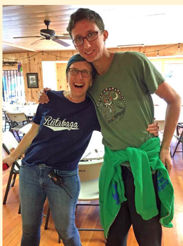
Owl and Rudy