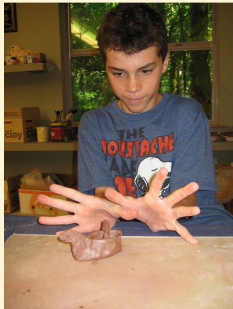
Grizzly in 2013

At the end of that very first session back in 2013, we asked the campers what their favorite parts of camp were. Grizzly said, "high-fiving my friends in the lunch room." Grizzly couldn't high-five his friends during lunch at school, but at Camp Blue Spruce, he could!